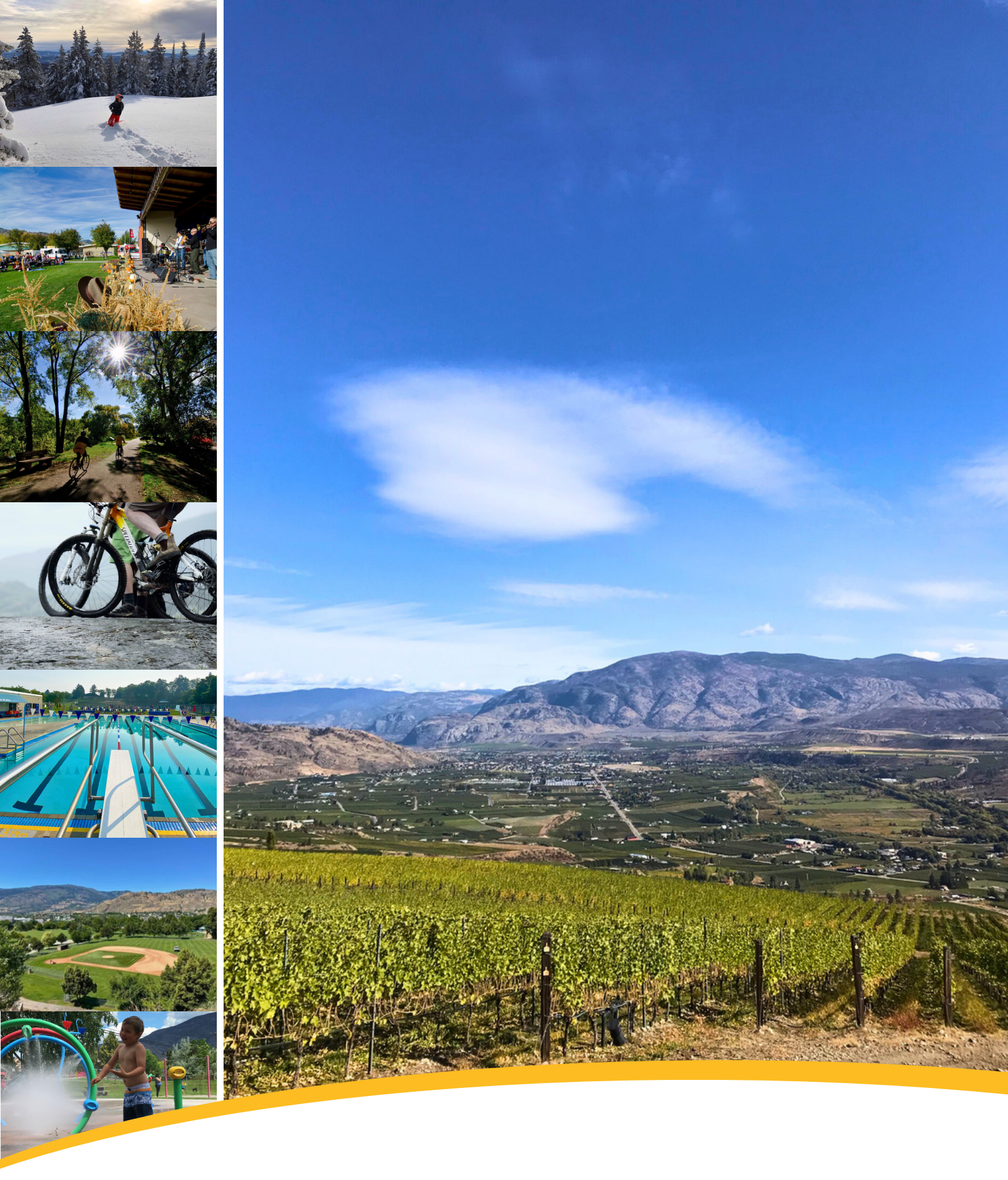
Come And Explore Oliver